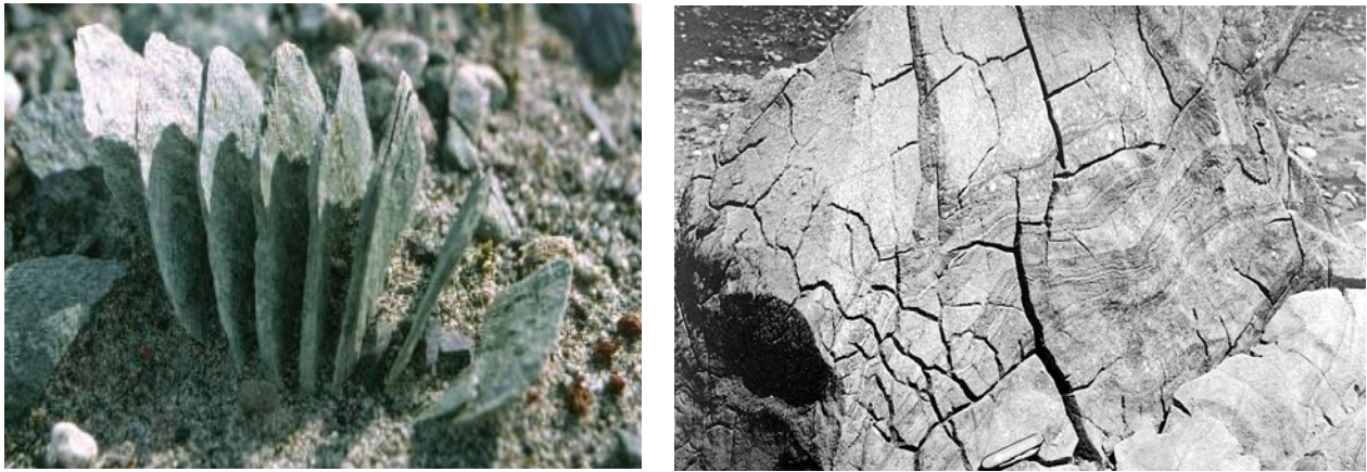
Figure 1: (A) Intact frost-sensitive cobbles are reduced to fans of rock slivers over decades [5] (left) (B) Rock fracture due to: Thermal Stress [8] (right)